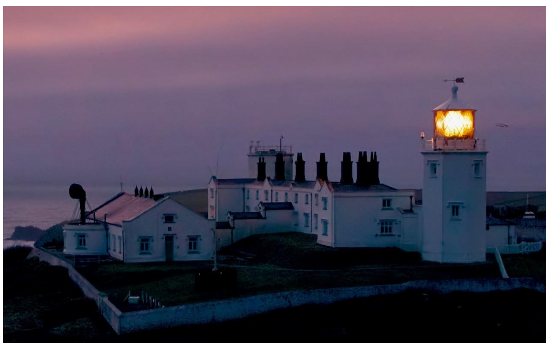
Figure 2 Lizard Lighthouse, England

Prior to the meeting, Judges had scored each lighthouse to narrow the field down to 3 lighthouses for IALA Council to consider in its determination of IALA Heritage Lighthouse of the Year 2021. These 3 lighthouses are detailed as follows together with a summary of their outstanding characteristics;