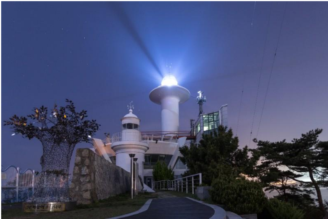
Figure 3 Palmido Lighthouse, Korea

This unique lighthouse ticks all the boxes. Within a cohesive single site there is a striking modern operational tower from 2003 and a historic tower (the tower it replaced) dating from 1903 – itself the oldest ‘modern’ lighthouse in Korea. Not to mention public visitor facilities including a museum, observation deck, and outdoor areas.