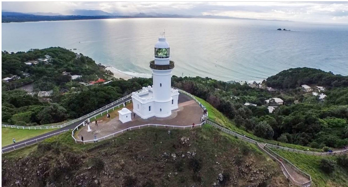
Figure 4 Cape Byron Lighthouse, Australia

This operational lighthouse and its former keepers' accommodation incorporates an interpretative centre, maritime museum, administration office, and café. It is a major tourist attraction with 500,000 visitors a year.